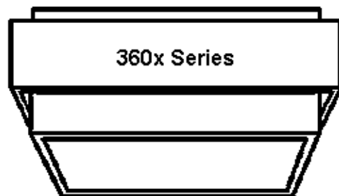
Dimensions = mm