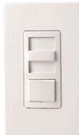
IPX06-1AW with optional wallplate